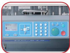
Large user-friendly LCD control panel conveniently stores job names.