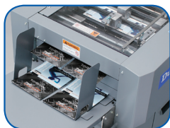
Adjustable receiving tray accommodates longer finished sizes. Plexiglas® cover provides direct view of machine in operation.