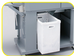
Margin, gutter slit, and gutter cut strips are automatically disposed in waste bin.