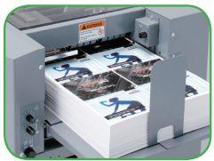
3.9"-capacity continuous automatic feeder allows for non-stop productivity.