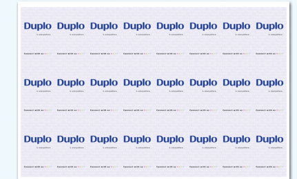
24-up Full-Bleed Business Cards on 12" x 18"